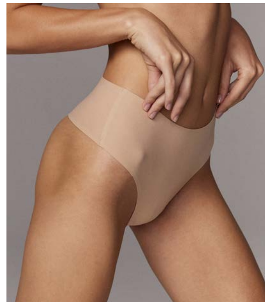
● TAN AR-U-0001-T XS S M L XL XXL