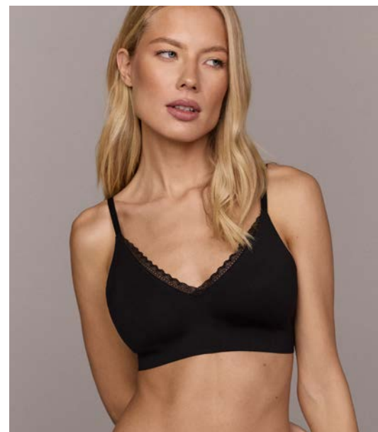
BLACK AR-B-0003-B S M L XL