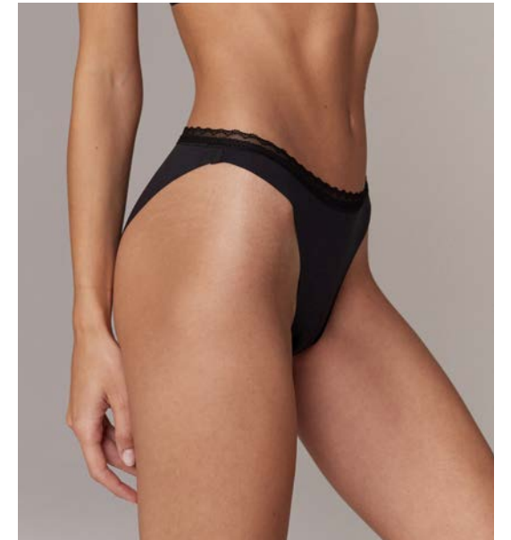
● BLACK AR-U-0011-B XS S M L XL XXL