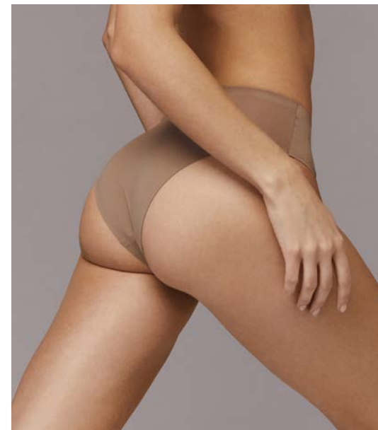
● CHOCO AR-U-0002-CH XS S M L XL XXL