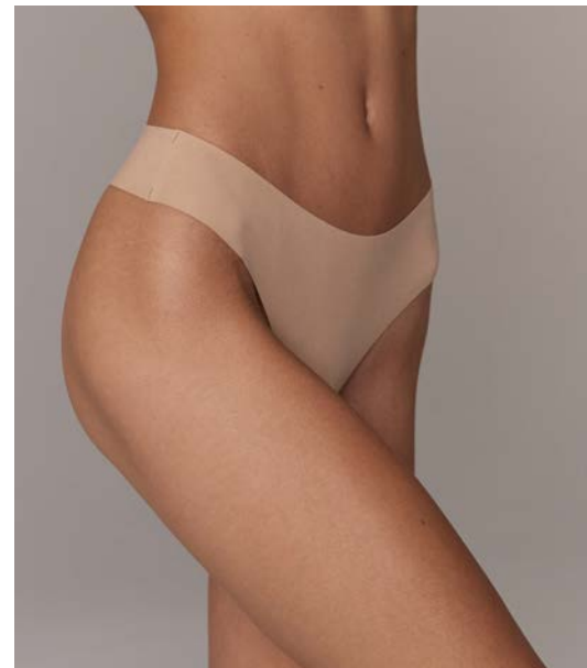
● TAN AR-U-0006-T XS S M L XL XXL