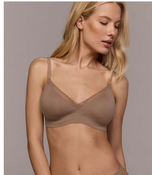
● CHOCO AR-B-0004-CH S M L XL