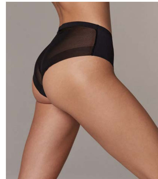
● BLACK AR-U-0013-B XS S M L XL XXL