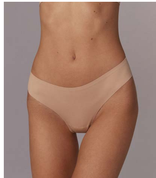
● TAN AR-U-0004-T XS S M L XL XXL