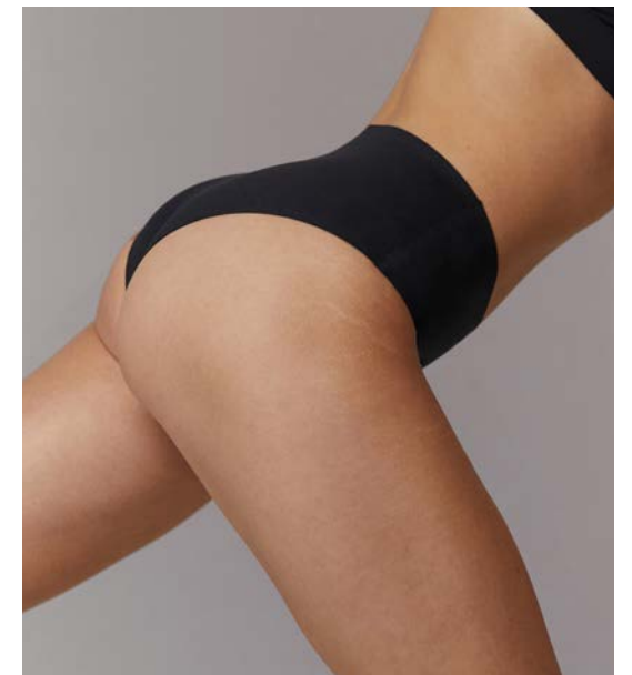
● BLACK AR-U-0003-B S M L XL XXL