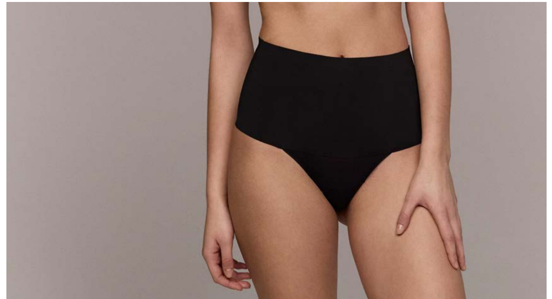
● BLACK AR-U-0015-B S M L XL XXL