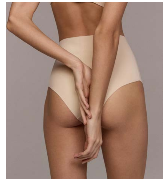
● NUDE AR-U-0015-N S M L XL XXL