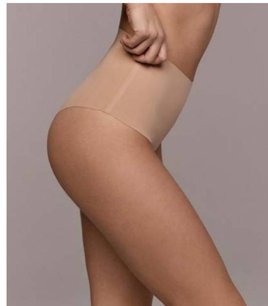
● TAN AR-U-0015-T S M L XL XXL