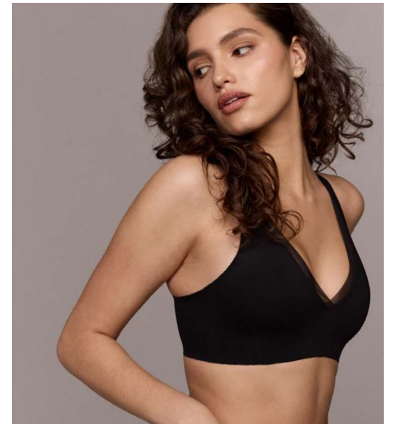
● BLACK AR-B-0002-B S M L XL