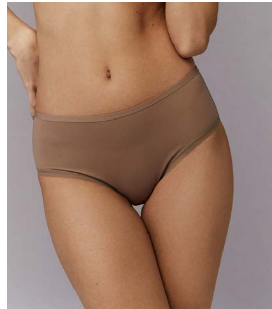
● CHOCO AR-U-0008-CH XS S M L XL XXL