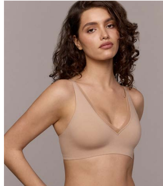
● TAN AR-B-0002-T S M L XL