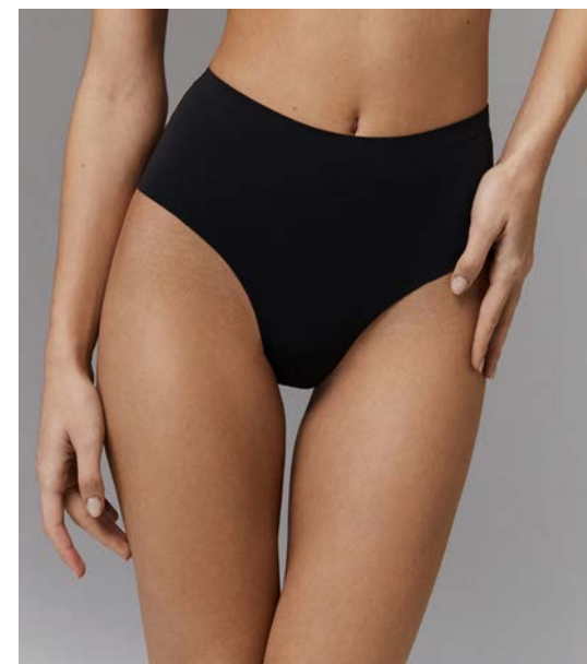
● BLACK AR-U-0009-B S M L XL XXL