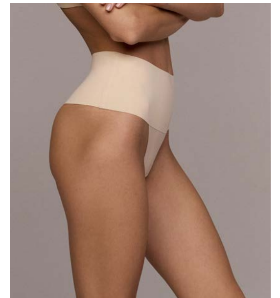
● NUDE AR-U-0014-N S M L XL XXL