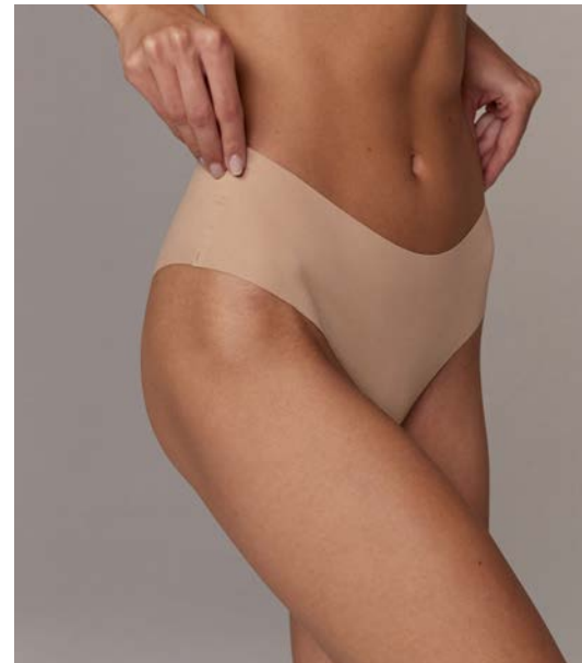
● TAN AR-U-0012-T XS S M L XL XXL