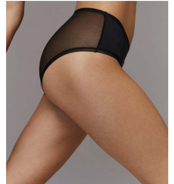
● BLACK AR-U-0008-B XS S M L XL XXL