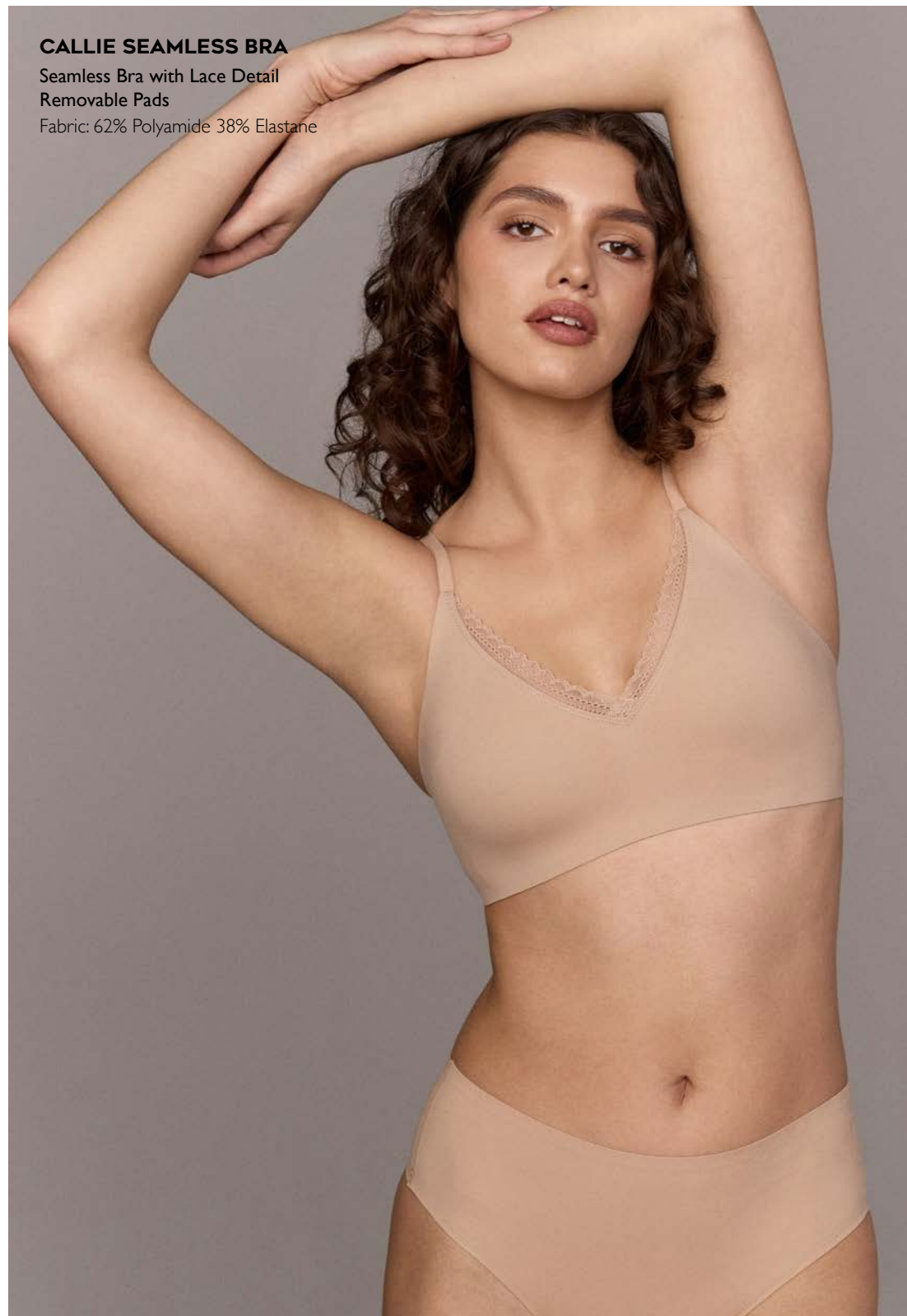
TAN AR-B-0003-T S M L XL

CALLIE SEAMLESS BRA Seamless Bra with Lace Detail Removable Pads Fabric: 62% Polyamide 38% Elastane