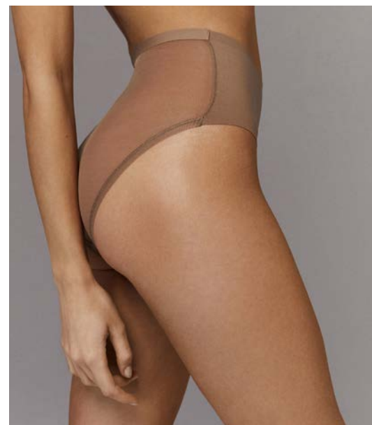
● CHOCO AR-U-0009-CH S M L XL XXL