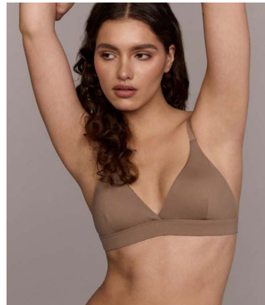
CHOCO AR-B-0001-CH XS S M L