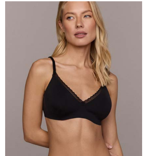
● BLACK AR-B-0004-B S M L XL