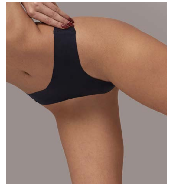
● BLACK AR-U-0006-B XS S M L XL XXL