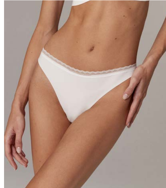
○ WHITE AR-U-0011-W XS S M L XL XXL