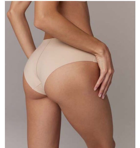
● NUDE AR-U-0012-N XS S M L XL XXL