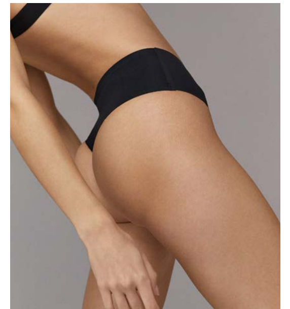
● BLACK AR-U-0001-B XS S M L XL XXL