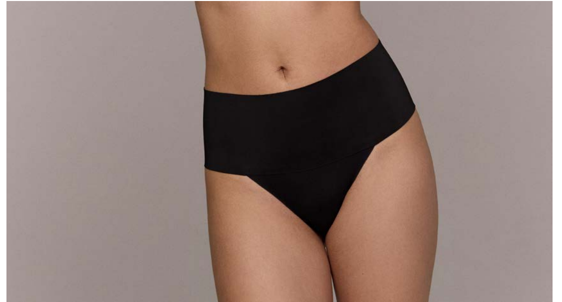
● BLACK AR-U-0014-B S M L XL XXL