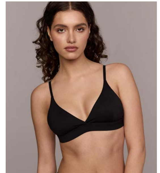
BLACK AR-B-0001-B XS S M L