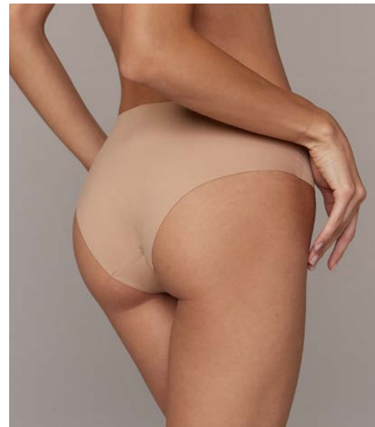
● TAN AR-U-0005-T XS S M L XL XXL