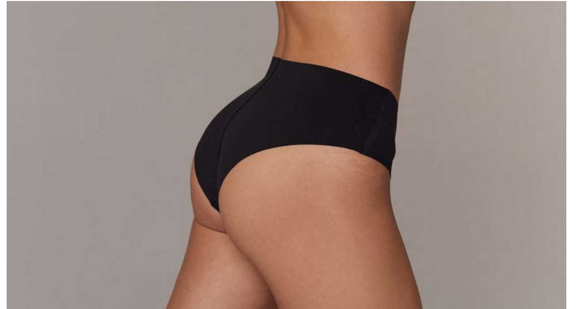
● BLACK AR-U-0012-B XS S M L XL XXL

Fabric: 62% Polyamide 38% Elastane Crotch Lining: 100% Cotton