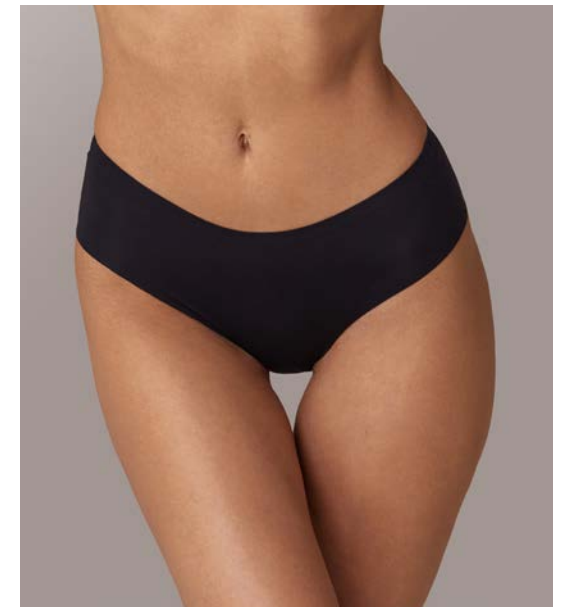
● BLACK AR-U-0005-B XS S M L XL XXL