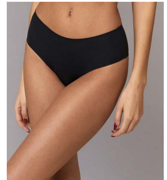
● BLACK AR-U-0002-B XS S M L XL XXL