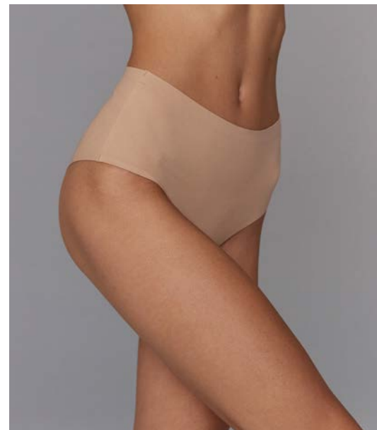
● TAN AR-U-0003-T XS S M L XL XXL