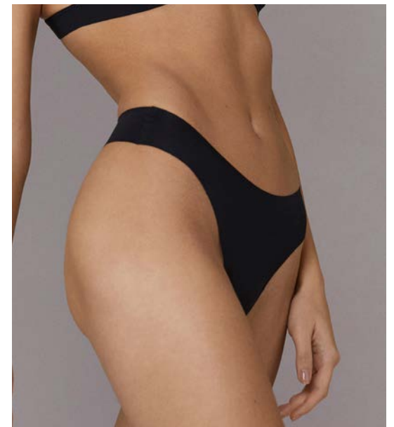
● BLACK AR-U-0004-B XS S M L XL XXL