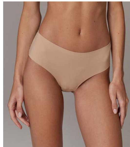
● TAN AR-U-0013-T XS S M L XL XXL